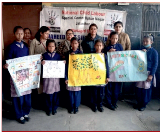
Gorakhpur, Uttar Pradesh