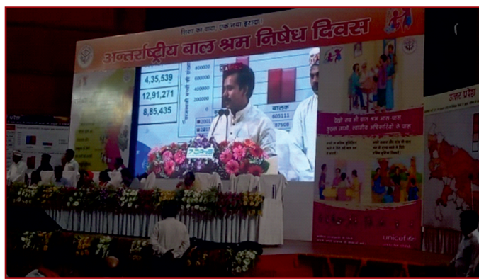
Mathura, Uttar Pradesh