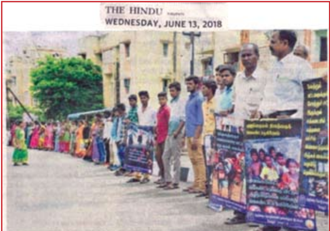
Child Labour Department employees and volunteers forming a human chain on Anti Child Labour Day in Vellore on Tuesday. They reminded people that children below 14 years should not be employed and instead be encouraged to attend school.