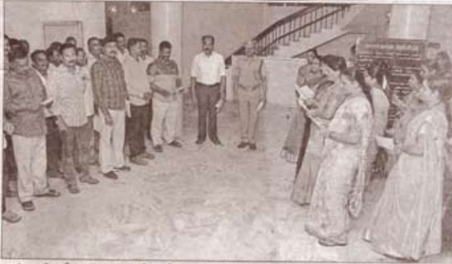
குழந்தை தொழிலாளர் முறை ஒழிப்பு தீர்மானப்போட்டி வேலூர் எல்லை அண்டுகையில் திருநெல்வேலி மாவட்டம் உருந்திடைக்கொண்டது.