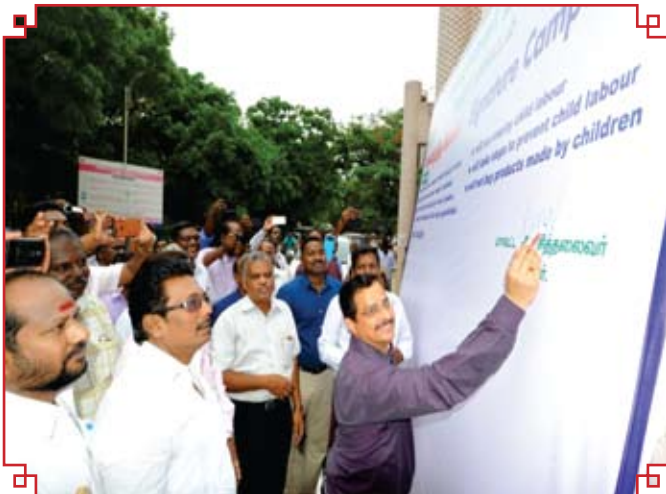
Inauguration of Signature Campaign Against Child Labour by District Collector