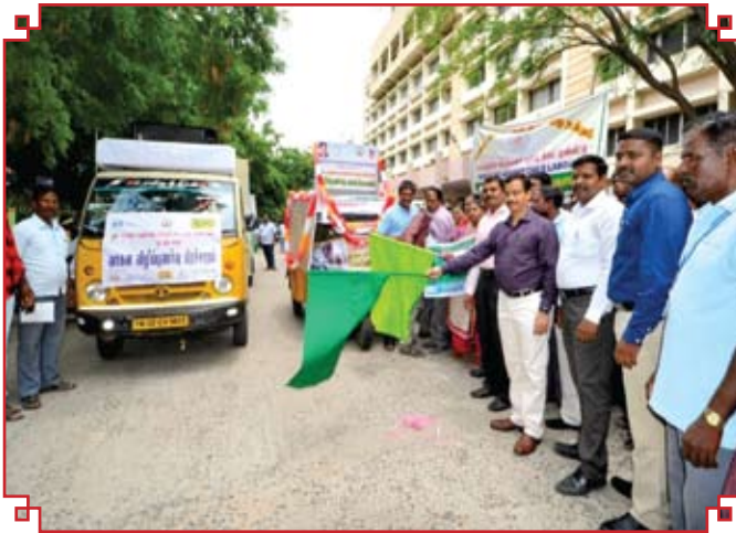
District Collector commencing and Flags Off the Awareness Generation on the issue of Child Labour through Transports jointly organised by NCLP, Hand in Hand & Child line 1098