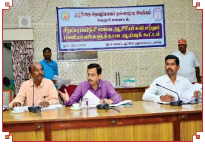
Vellore NCLP Review Meeting chaired by the District Collector