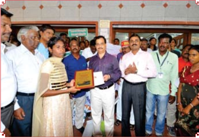
District Collector, Vellore District, conferring awards to the former Students of NCLP-STC, who have secured highest ranks in the 10th and the 12th standard Board Exams