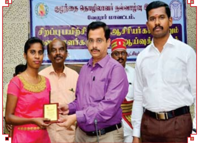
District Collector felicitating mainstreamed students from NCLP who have completed their professional studies such as B.A.B.L;B.E.; Diploma in E.C.E; D.C.E., etc