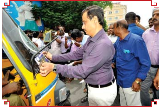
Inauguration of Sticker Campaign Against Child Labour by District Collector