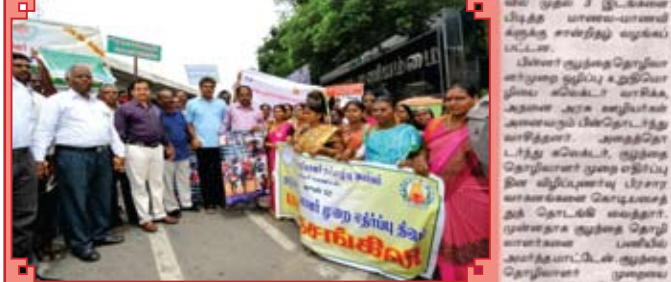
Inauguration of Human Chain Against Child Labour by District Collector