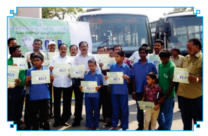
Release and Pasteing of NCLP stickers on RTC buses