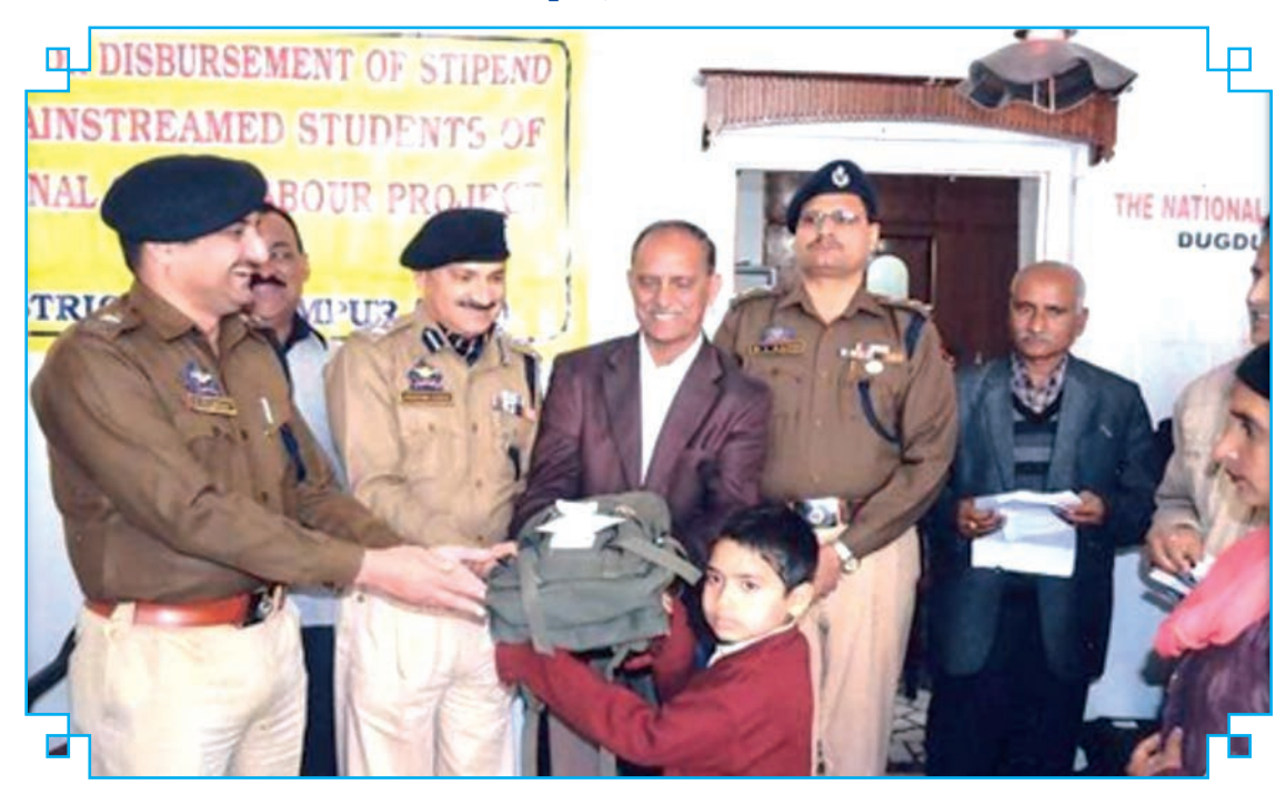
Distribution of Uniforms, School bags, shoes and socks, sweaters and Rs. 150/- stitching charges to NCLP students