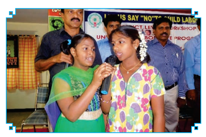
Workshop in collaboration with Unicef