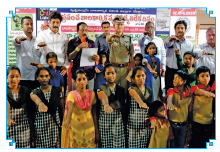
Oath taking ceremony