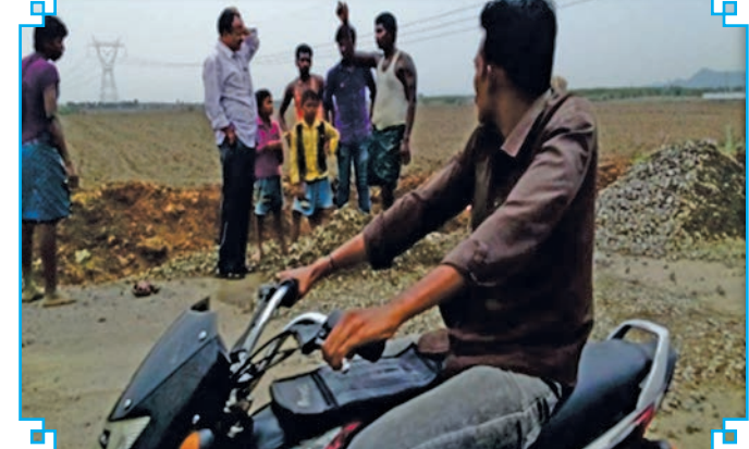
Identification of Child Labourers