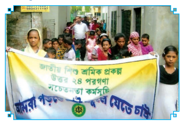
Highlights of some Rallies conducted