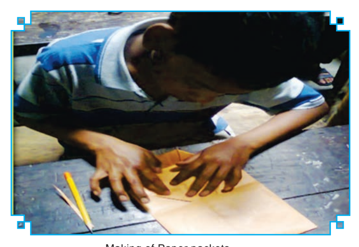
Making of Paper packets