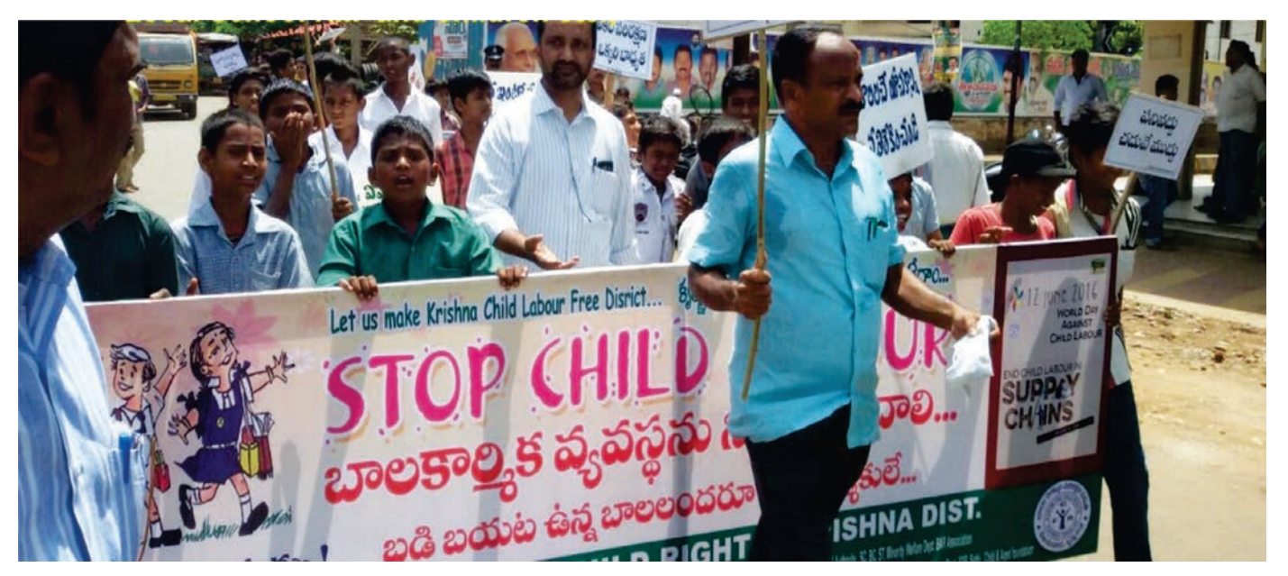
Rally against Child Labour