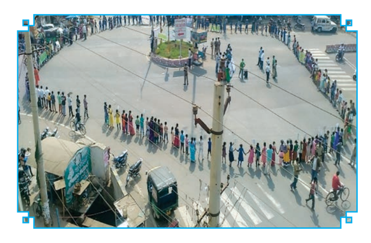
Human Chain against Child Labour